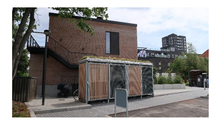
Go up the stairs.

This is what Krimsvej 15A looks like - seen from the road: